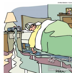
Monday: Missed the snooze – hit the ooze button.

Source: Make it a Winning Life Perpetual Calendar, http://www.wolfrinke.com/calendar.html