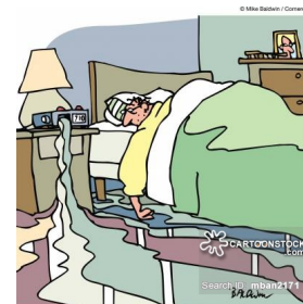
Monday: Missed the snooze – hit the ooze button.

Source: Make it a Winning Life Perpetual Calendar, http://www.wolfrinke.com/calendar.html